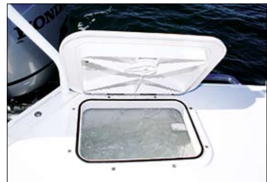
A good sized live bait tank.