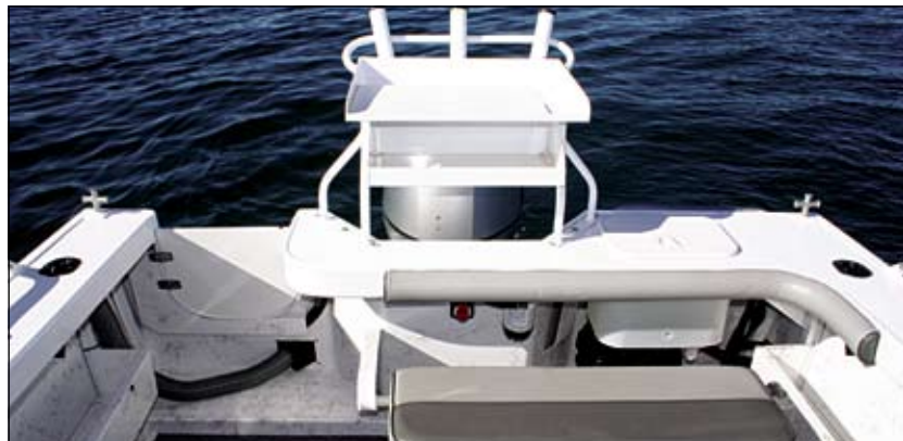
Transom door on the left, folding rear lounge on the right and bait board centre are some of the features that make this boat a good all-round package.

Not all these options are going to be needed