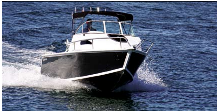
The hull design ensures a quality ride in all conditions.

by everyone and you can pick and choose depending on the main application of the boat.