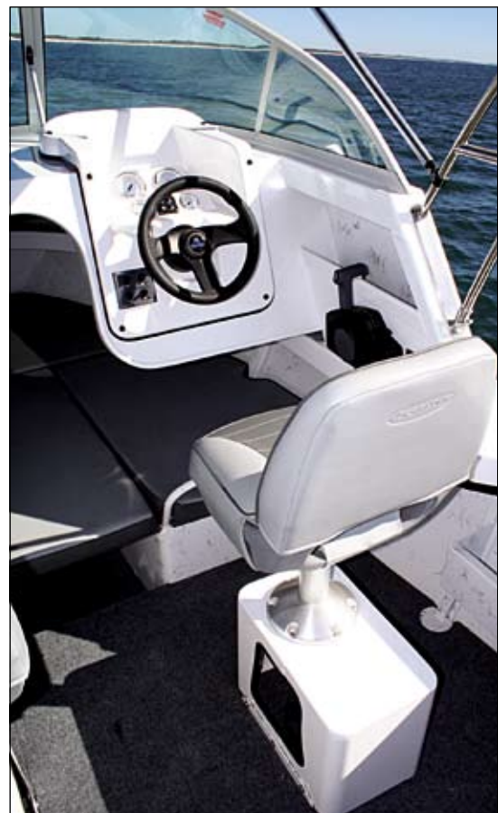
Cabin infill gives you plenty of sleeping room. Note the storage area under the helm seat.

Length Overall: 6.02m Beam: 2450mm Material Bottoms: 5mm Material Sides: 3mm Transom: XLS Max Transom Weight: 240Kg Max Horsepower: 175hp Number of People: 6