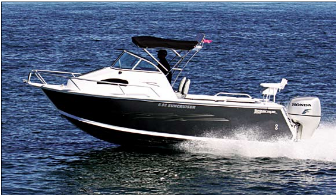
The 135hp Honda 4-stroke has plenty of punch to get the 6m Seascope up and planing.