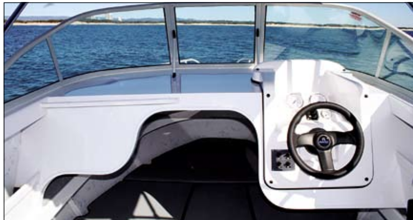
The helm area has good vision and plenty of room for electronics.