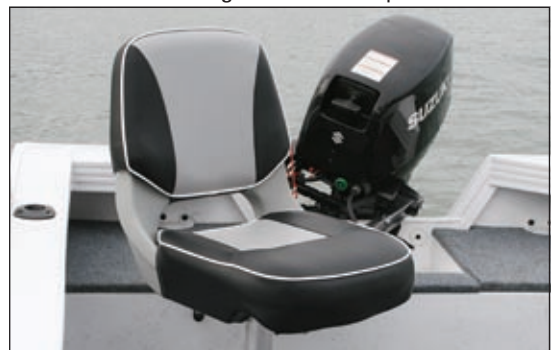
A well situated driving position.