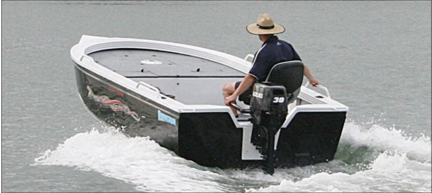
A 30hp Suzuki is an economical yet powerful option for the Seascape Viper.